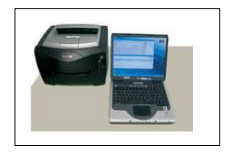
Illustration 2: low paperversion